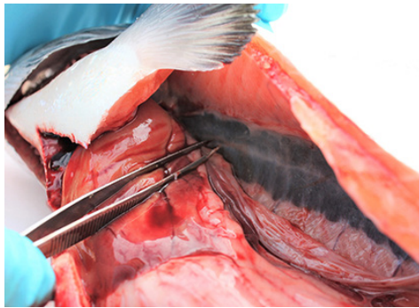
Kidney (head kidney, front part)