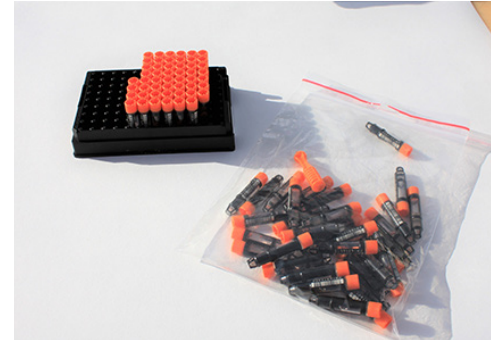
Submission of test tubes in a plastic bag