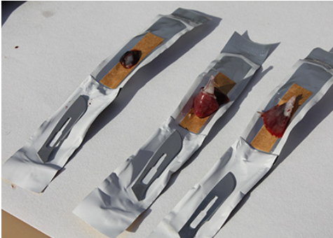
Trimming of the tissue on the scalpel package